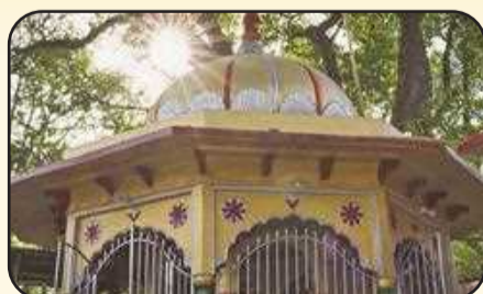
Mankameshwar Temple Corridor