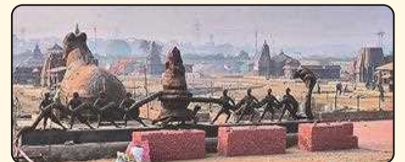
9. Shivalay Park