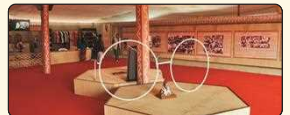
7. Kala Gram