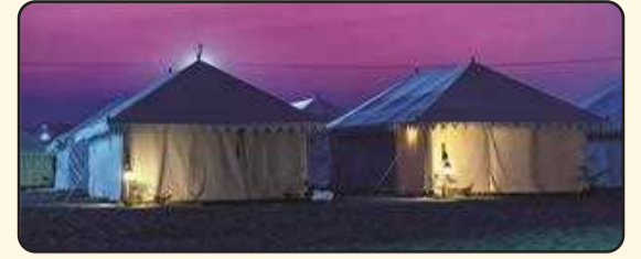
1. Tent City