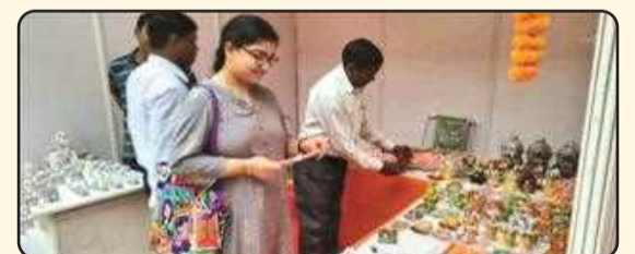
8. Exhibitions of ODOP, NMCG & Handicraft