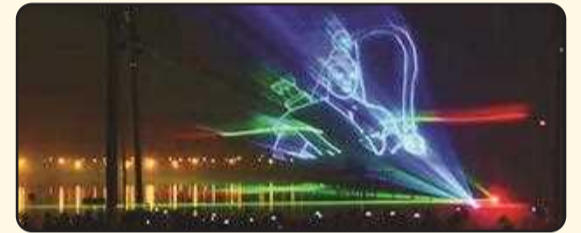
4. Water Laser Show