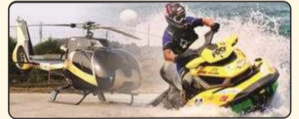
3. Helicopter Rides/Water Activity