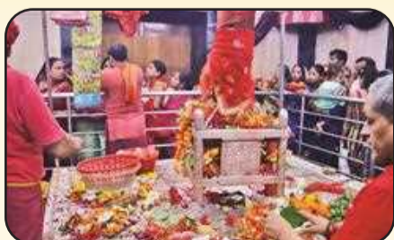
Alop Shankari Devi Temple