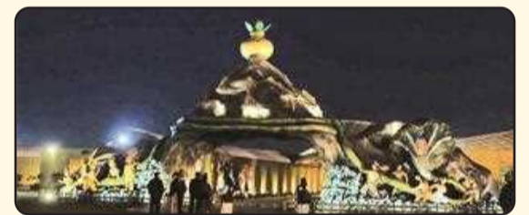
6. Sanskriti Gram