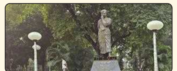
10. Heritage Walk