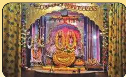
Dwadash Madhav Temple