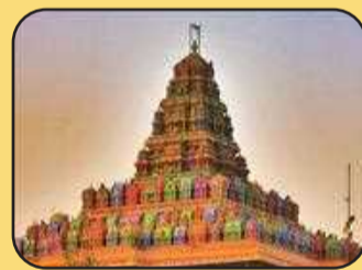
Shankar Viman Mandapam