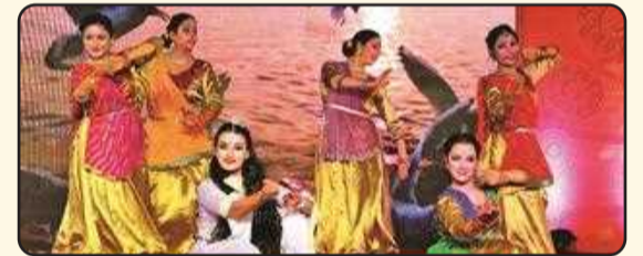
5. Cultural Performances