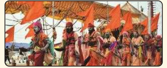
2. Mahakumbh Akhara Tour