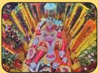
Shri Lete Hanuman ji Corridor